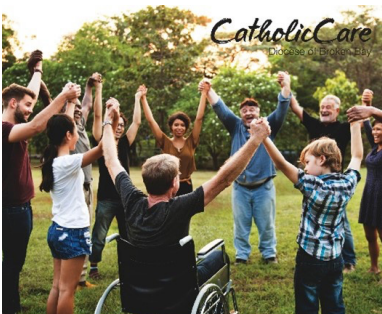
SUPPORTING PARISHIONERS ACROSS OUR DIOCESE

It's true! CatholicCare is here to help and offer many services for people in need including emergency relief financial supports, homelessness and housing assistance, domestic violence support, counselling including financial counselling, disability and seniors supports and more. We have recently produced a flyer specifically for parishes here . Feel free to call 1800 324 924 or visit www.catholiccaredbb.org.au for more information.